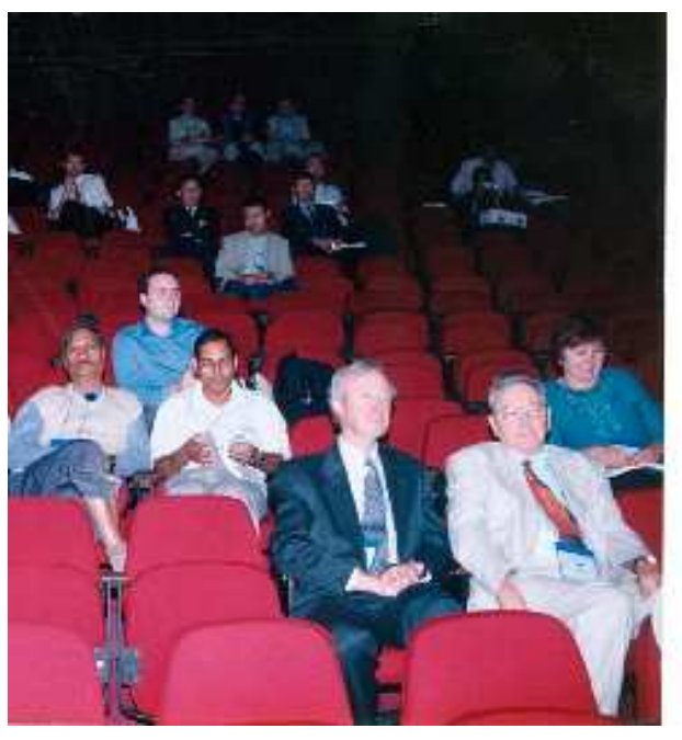
Fig. 4. Two EPR luminaries: Profs Stankowski & J. Pilbrow.

In this Section, I will share with you some memories of Prof. Stankowski during the Symposium as well as during the official sightseeing trips and, most interestingly, our 'private' sightseeing and shopping escapades around Bangalore using local transportation by rickshaws. Selected 'snapshots' include some photos taken by Prof. Stankowski himself and kindly sent to me after APES'04.