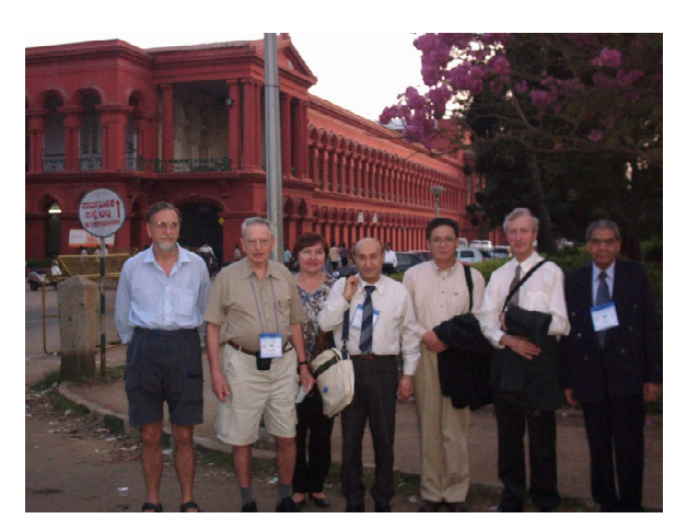
Fig. 8. At the official sightseeing trip around Bangalore.