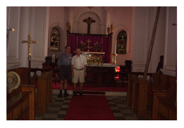
Fig. 10. At a Catholic Church in Bangalore.