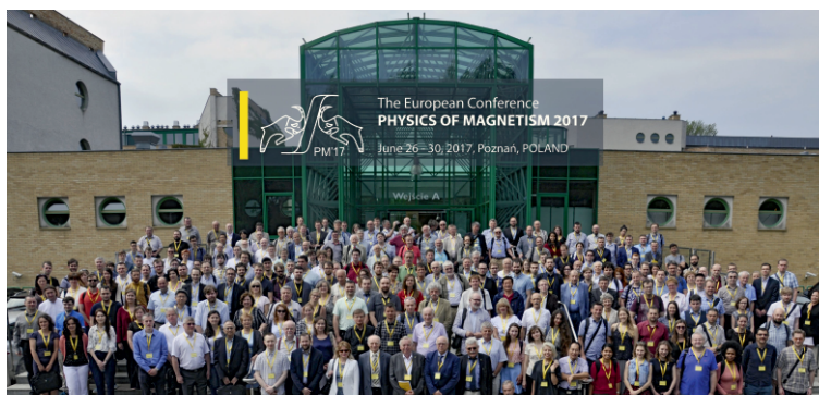
Group photo from PM'17 (382 scientists from 31 countries in the total list of participants).

The European Conference Physics of Magnetism is a traditional gathering of leading researchers who are active in the field of magnetism with emphasis on solid state phenomena. Many distinguished lecturers from all over the world took part in previous editions of this Conference (see e.g. www.ifmpan.poznan.pl/pm17 ). Our meeting will enable direct contact between exhibitors and scientists from leading research groups. For this occasion, the attention on a well-established area of interest will be expanded by including a special category of abstracts dedicated to /Measuring Techniques and Instruments/, conceived for the needs of engineers and technologists working in industry.